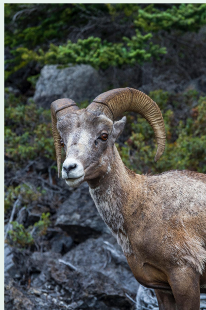
Bighorn sheep

Join Sonia today by becoming a monthly donor to take part in our mission to protect wildlife and build a bright future for everyone.